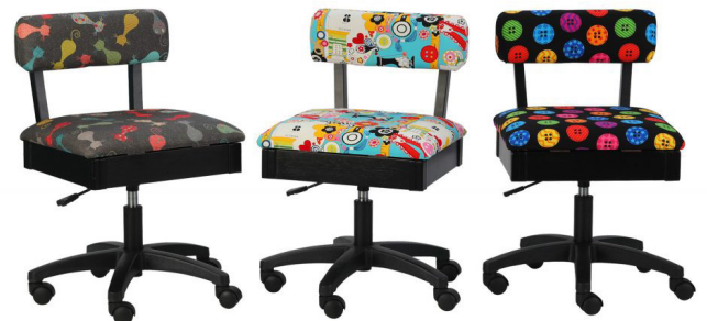
Cat's Meow, Sew Wow Sew Now & Bright Buttons Chairs

The cherry on top of your sewing sundae! Arrow's #1 Rated Height Adjustable Sewing Chair is a must have accessory for your dream sewing room! Cute, comfortable and convenient - our lovable chairs feature vibrant sewing themed patterns, 360° swivel access and lumbar support for long hours at your workstation. Don't look now, but under every seat cushion is a hidden storage compartment to store your notions and patterns! Available in 10 colors to perfectly match your sewing sanctuary!