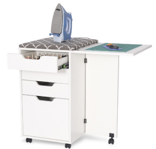
Kiwi Storage Cabinet

Every dream sewing oasis needs its cute, dependable accessories! Add even more convenience with a storage cabinet like Kiwi , featuring a built-in ironing board, cutting mat, thread drawers and a dedicated drawer to store your iron! Your dream sewing space won't be the same without it!