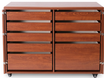
Dingo Cutting Table

Kangaroo sewing cabinet - check! Now complete your studio with Kangaroo storage and cutting furniture, specially designed to complement your primary workstation. With extra storage and workspace, you can customize your sewing room to be stylish, comfortable, and even more productive!