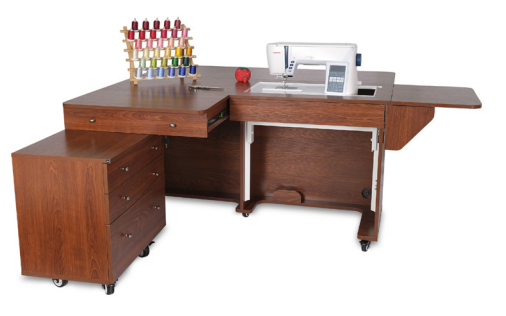
Kangaroo & Joey Sewing Cabinet

Kangaroo sewing cabinet - check! Now complete your studio with Kangaroo storage and cutting furniture, specially designed to complement your primary workstation. With extra storage and workspace, you can customize your sewing room to be stylish, comfortable, and even more productive!