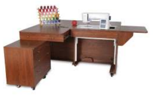
Kangaroo & Joey Sewing Cabinet

Kangaroo sewing cabinet - check! Now complete your studio with Kangaroo storage and cutting furniture, specially designed to complement your primary workstation. With extra storage and workspace, you can customize your sewing room to be stylish, comfortable, and even more productive!