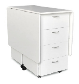
Kookaburra Cutting Table

Every dream sewing oasis needs functional, dependable accessories! Add even more convenience with a cutting table like Kookaburra , featuring two fold out leaves, four self-closing drawers, four rear removable shelves, and locking casters for easy mobility! Your dream sewing space won't be the same without it!