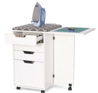
Kiwi Storage Cabinet

Every dream sewing oasis needs its cute, dependable accessories! Add even more convenience with a storage cabinet like Kiwi , featuring a built-in ironing board, cutting mat, thread drawers and a dedicated drawer to store your iron! Your dream sewing space won't be the same without it!