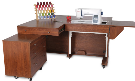
Kangaroo & Joey Sewing Cabinet

Sewing cabinets provide comfort, easy set-up and dedicated storage for your machine and notions. They produce an enjoyable, ergonomic sewing experience and create a spirited environment for sewing and crafting! Your machine deserves better than the dining room table, and so do you! Sew in comfort and sew longer with Kangaroo's sewing cabinets!