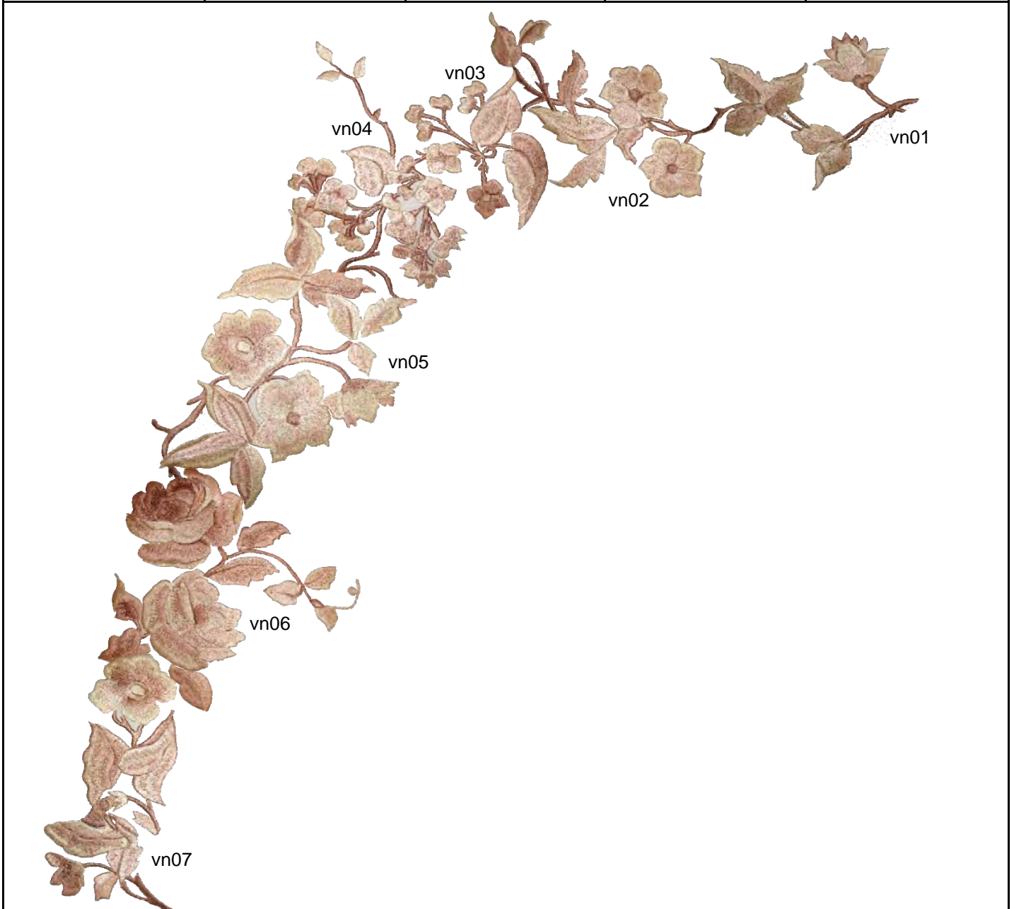
Combination Design: vn01, vn02, vn03, vn04, vn05, vn06 and vn07.